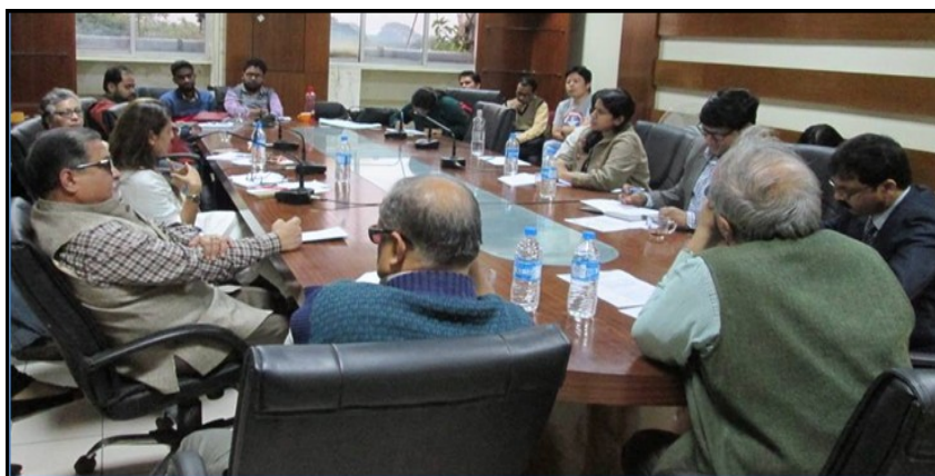
Participants of the ASEAN@50 and ASEAN-India@25 roundtable meeting

To commemorate the 25 years of ASEAN-India Partnership and 50 years of ASEAN, ASEAN-India Centre (AIC) at RIS in partner with Institute of Foreign Policy Studies (IFPS) of Calcutta University and Centre for Studies in International Relations and Development (CSIRD) organised a roundtable on "ASEAN@50 and ASEAN-India@25" at Calcutta Univer-