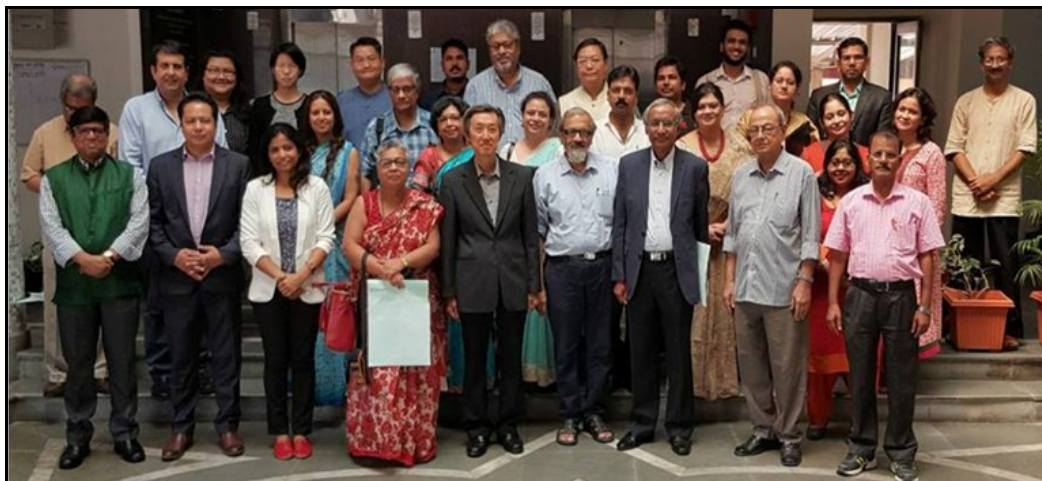
Group photo of the participants attended the Joint International Workshop on India-Myanmar-Thailand Trilateral Relations on 6-7 September 2017, Kolkata.