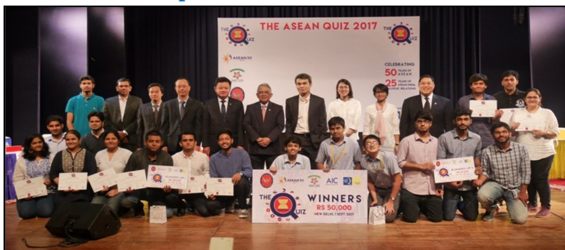
ASEAN Delegates and Grand Finale Contestants.

The Royal Thai Embassy, in collaboration with the ASEAN New Delhi Committee and the ASEAN-India Centre at RIS, organized 'The ASEAN Quiz' on 1st September 2017 at Arya Auditorium, New Delhi. The event marked the celebration of the 50th anniversary of the establishment of ASEAN and the 25th anniversary of ASEAN-