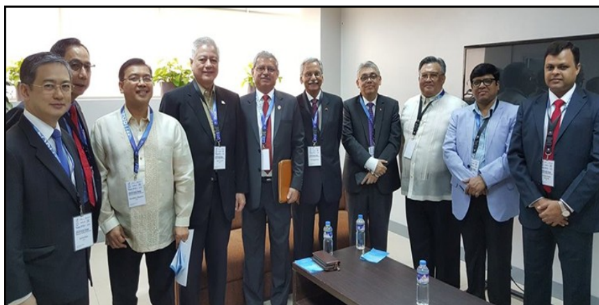
Group photo of the participants attended the ASEAN-India Forum on 21 November 2017, Manila.