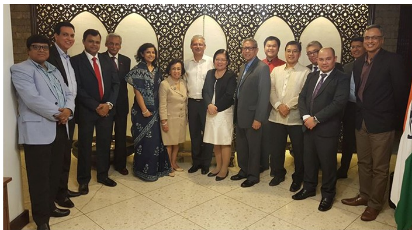
Group photo of the participants attended the ASEAN-India Forum on 21 November 2017, Manila.

The Forum was divided into four sessions to identify the challenges and way forward in