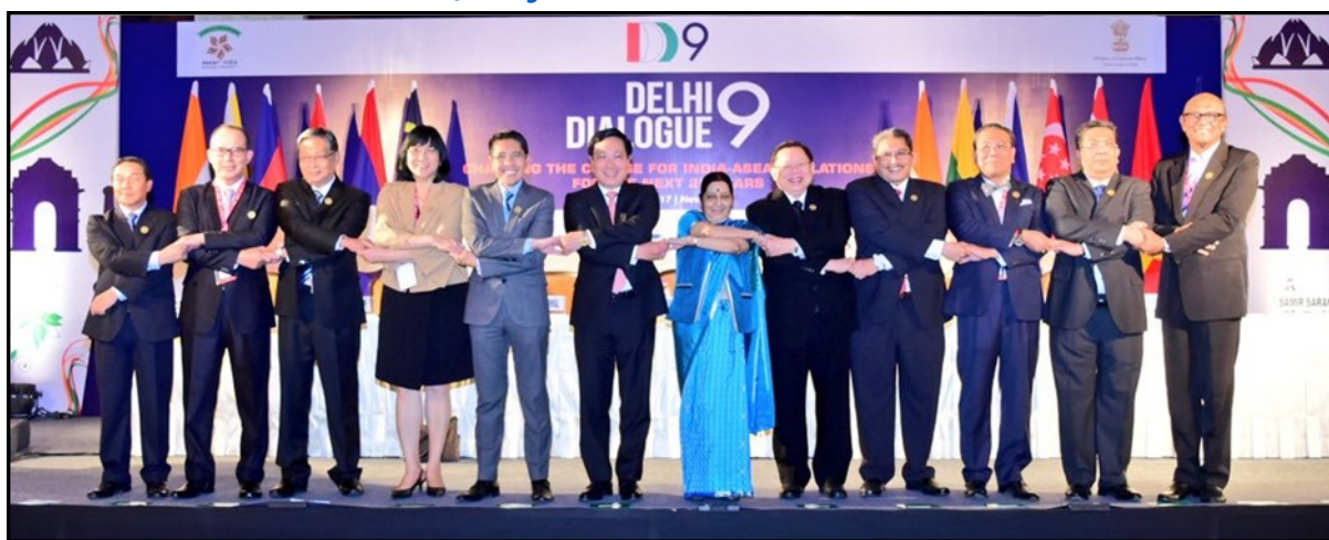
Smt. Sushma Swaraj, Hon'ble External Affairs Minister, Government of India with other dignitaries of ASEAN countries at the Delhi Dialogue IX.

Smt. Sushma Swaraj, Hon'ble External Affairs Minister, Government of India inaugurated the two-day Delhi Dialogue IX on 4 July 2017 at New Delhi, on the theme "ASEAN-India Relations: Charting the Course for the Next 25 Years". This dialogue is being organised by the Ministry of External Affairs (MEA) in collaboration with the Observer Research Foundation (ORF); Federation of Indian Chambers of Commerce and Industry (FICCI); Institute of South Asian Studies (ISAS), Singapore; SAEA Group Research, Singapore; Economic Research Institute for ASEAN and East Asia (ERIA), Jakarta;