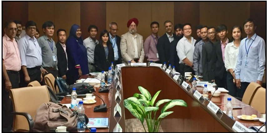
Group Photo, ASEAN Journalist with Amb. Hardeep Singh Puri