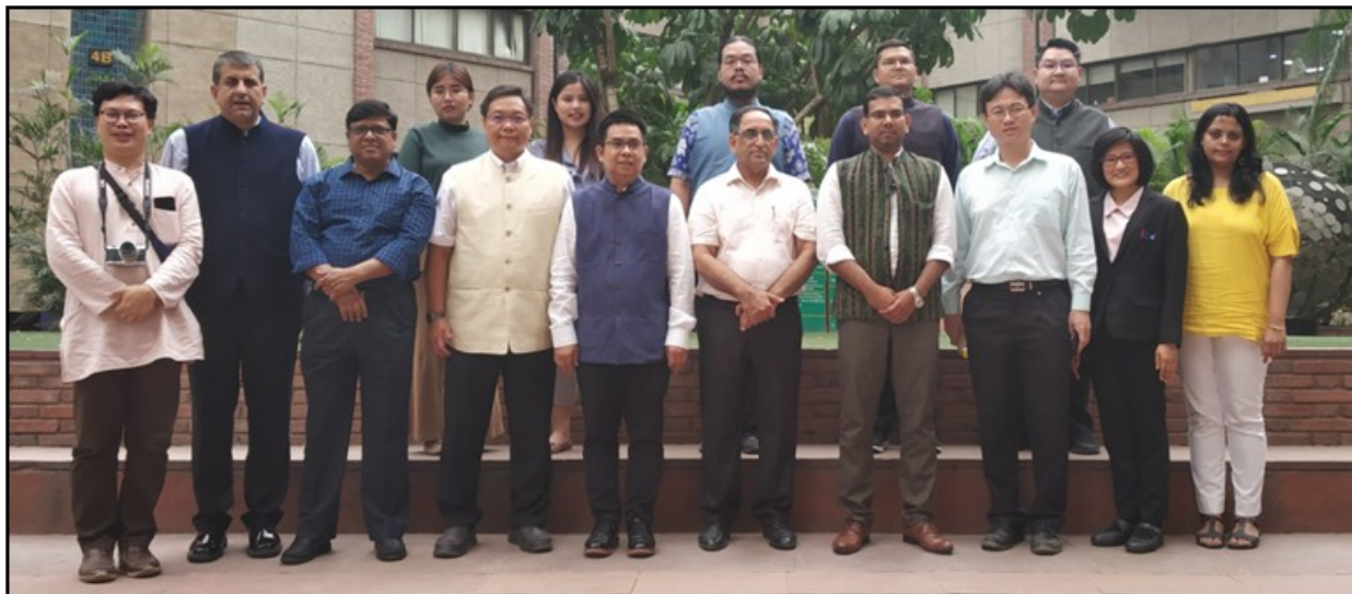
Group photo with Thailand Delegates.