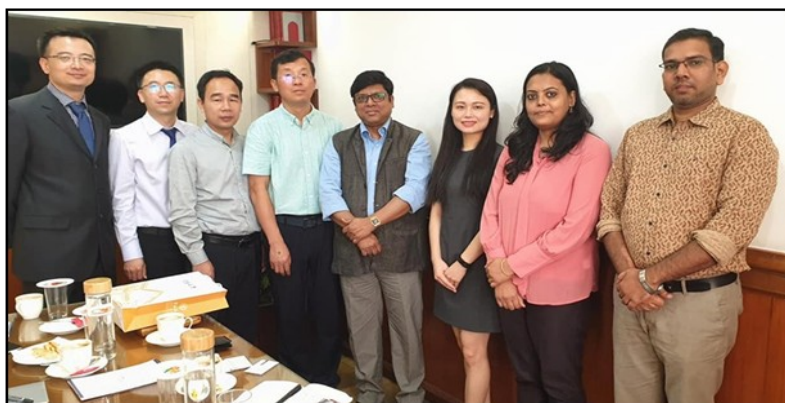
Group photo with Delegation of Yunnan University.