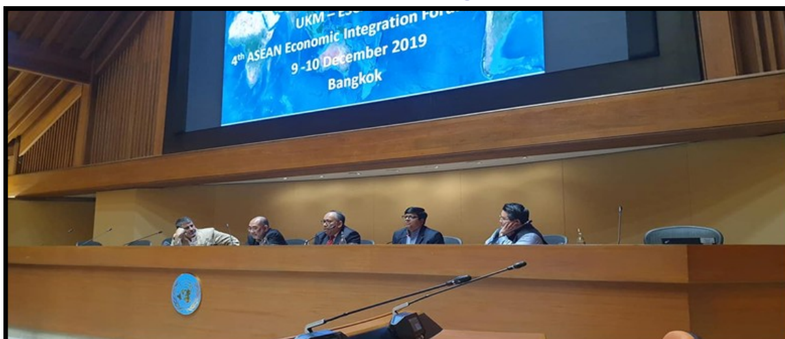
Session on ASEAN in the Indo-Pacific, Opportunities and Challenges for Future Economic Development' at UNESCAP, Bangkok on 9 December 2019