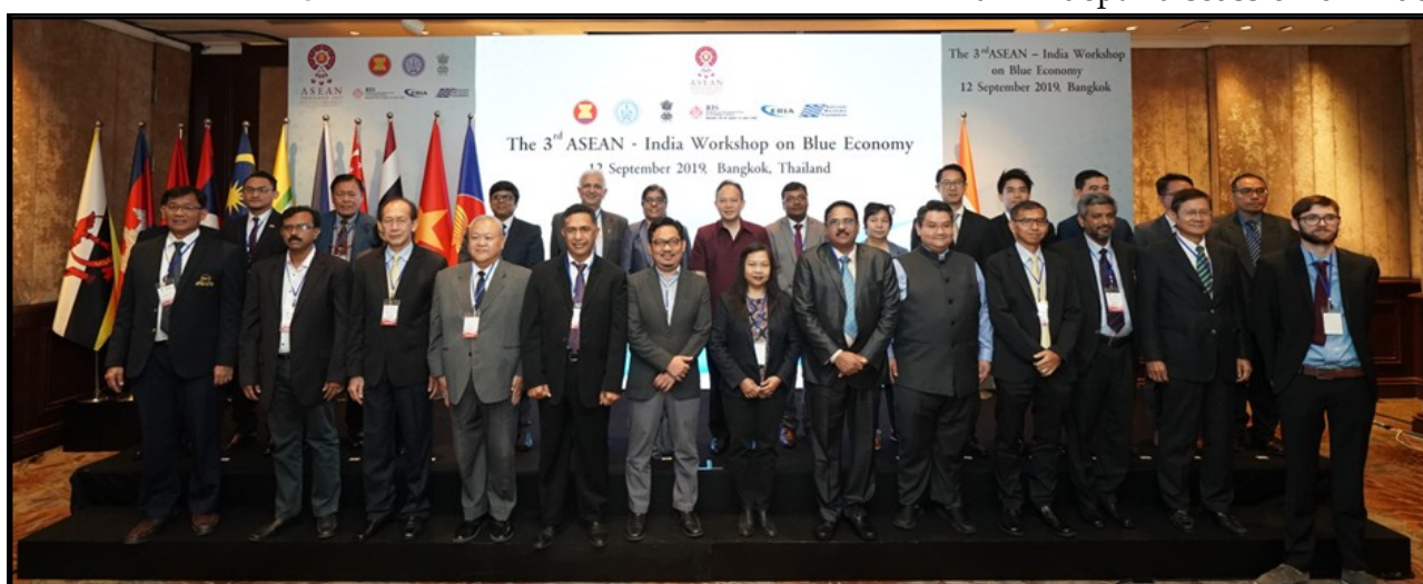
Group photo of Third ASEAN-India Workshop on Blue Economy

The Ministry of Foreign Affairs (MFA) of Thailand, jointly with the Ministry of External Affairs (MEA) of India, the Economic Research Institute for ASEAN and East Asia (ERIA), Jakarta, the National Maritime Foundation (NMF), New Delhi and the Research and Information System for Developing Countries (RIS), New Delhi organised the third ASEAN-India Workshop on Blue Economy on 12 September 2019 in Bangkok. Dr. Suriya Chindawongse, Director-General of the Department of ASEAN Affairs, Ministry of Foreign Affairs of Thailand delivered the Opening Remarks. The Keynote Address was delivered by H.E. Ms. Suchitra Durai, Ambassador of India to Thailand. The Workshop was attended by ASEAN Member States, senior officials and about 100 participants from ASEAN and India. The workshop was divided into four sessions to facilitate an in-depth discussion on Blue