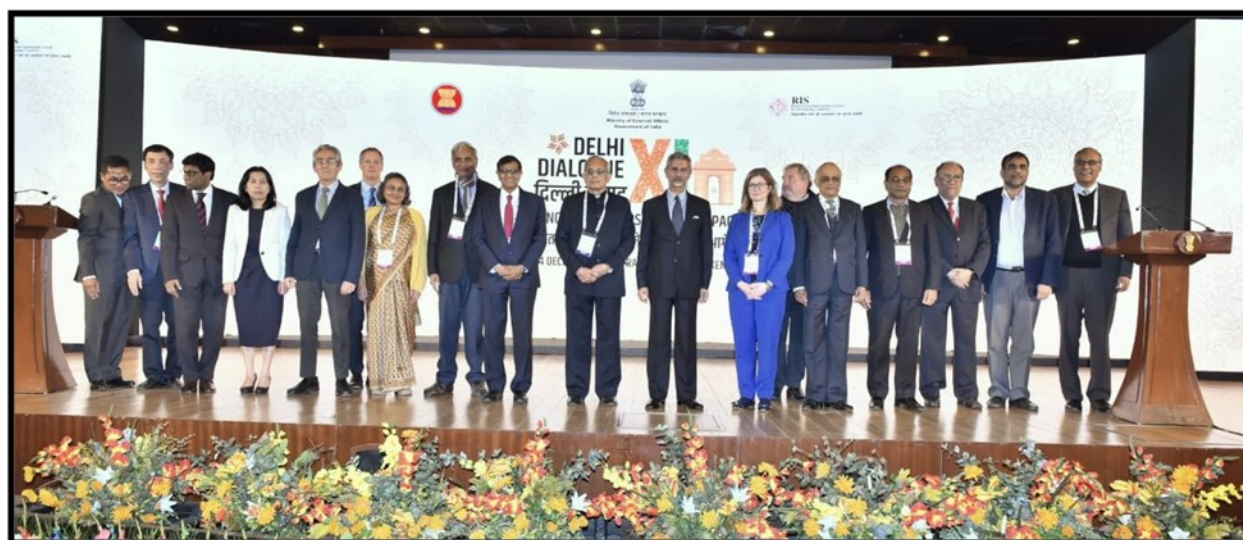
Group photo of Delegates with Dr.S. Jayasankar, External Affairs Minister of India.