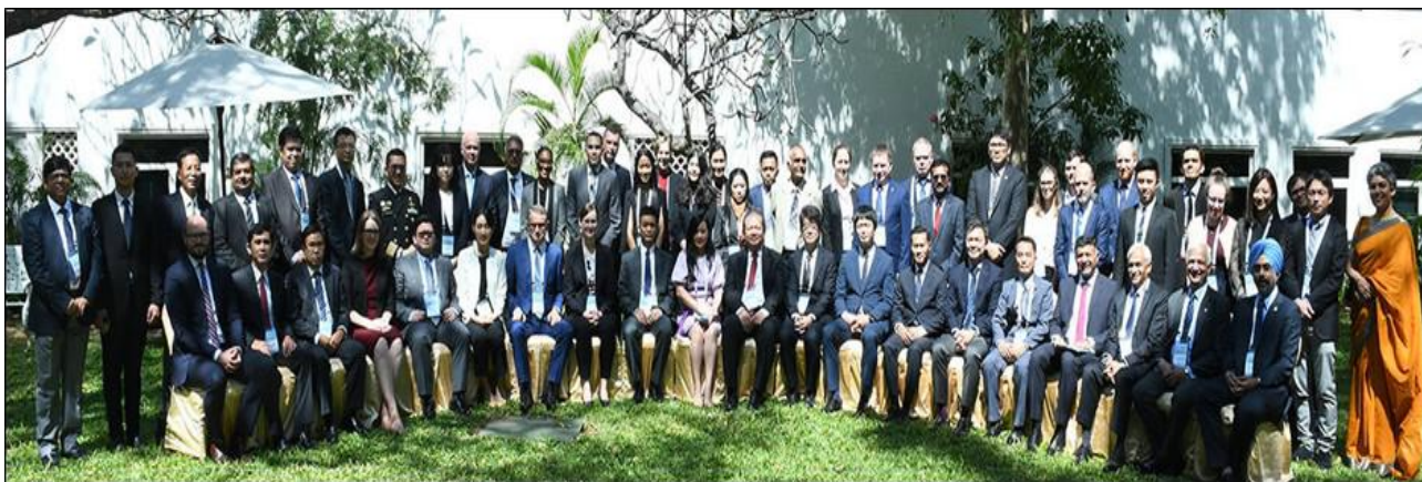
Group Photo of 4th EAS Conference, 6 February 2020, Chennai.