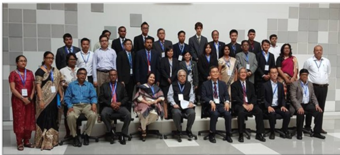
Group Photo: Participants of the International Workshop, 26 – 27 October 2016, Kolkata