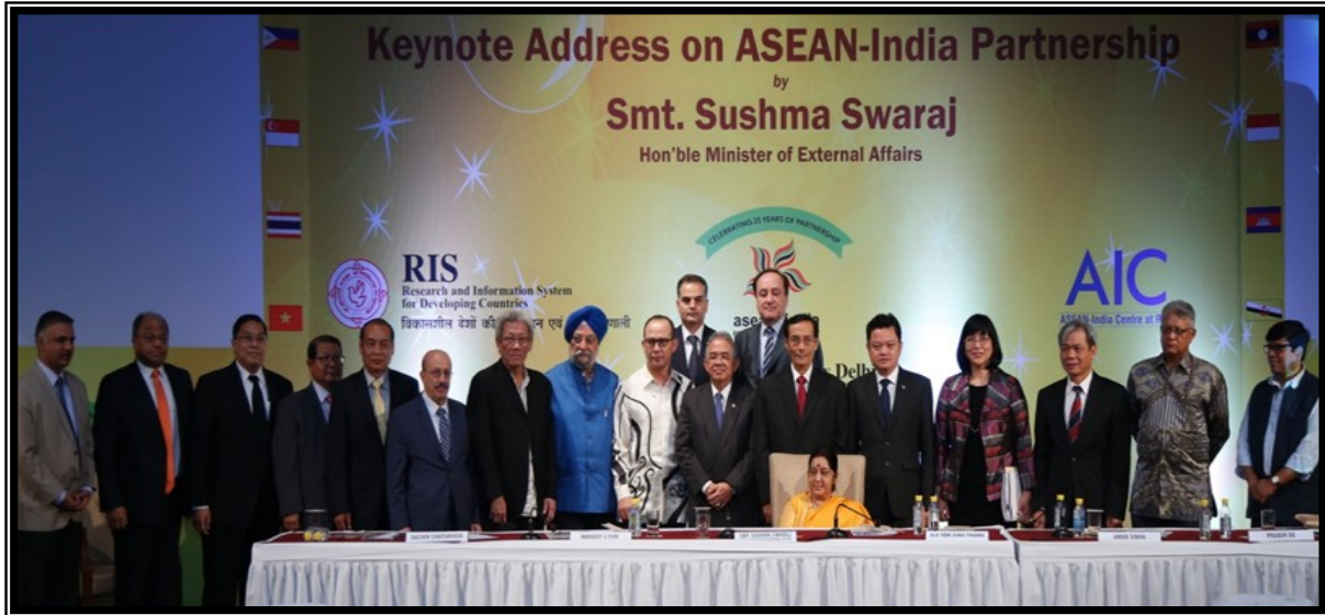
Ambassadors and senior officials of ASEAN countries with Hon'ble EAM.